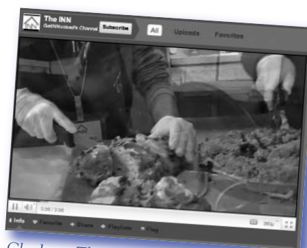
Check out The INN's new video on YouTube at http://www.youtube.com/user/GetINNvolved or view it on The INN's website at www.the-inn.org .