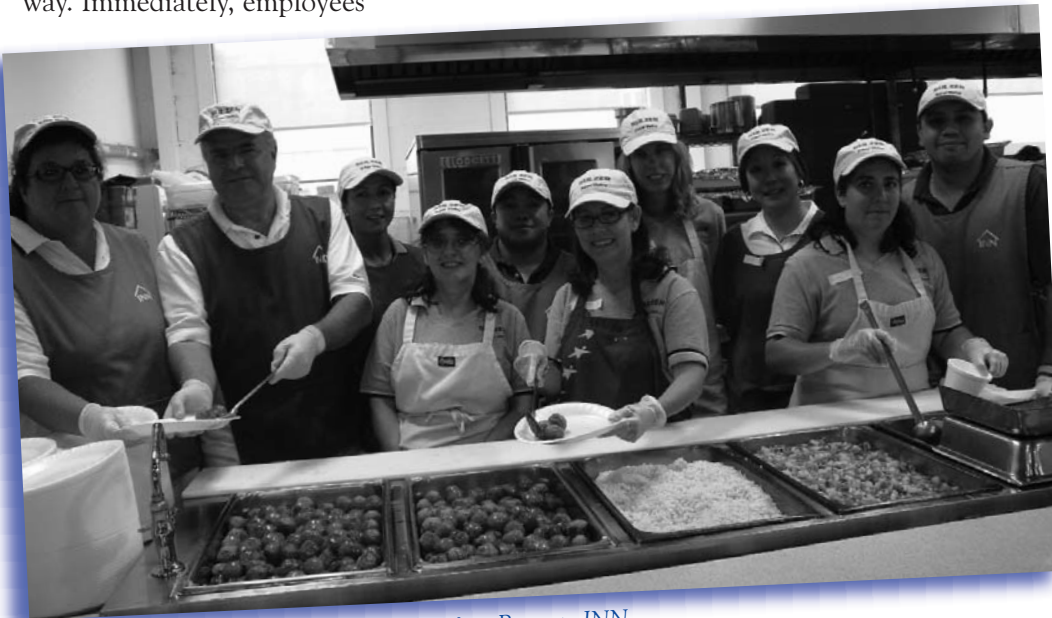
Sulzer Metco employees serving lunch at the Mary Brennan INN.

participated with deep conviction and a lot of enthusiasm. Sulzer Metco began reaching out to The INN with generous contributions.